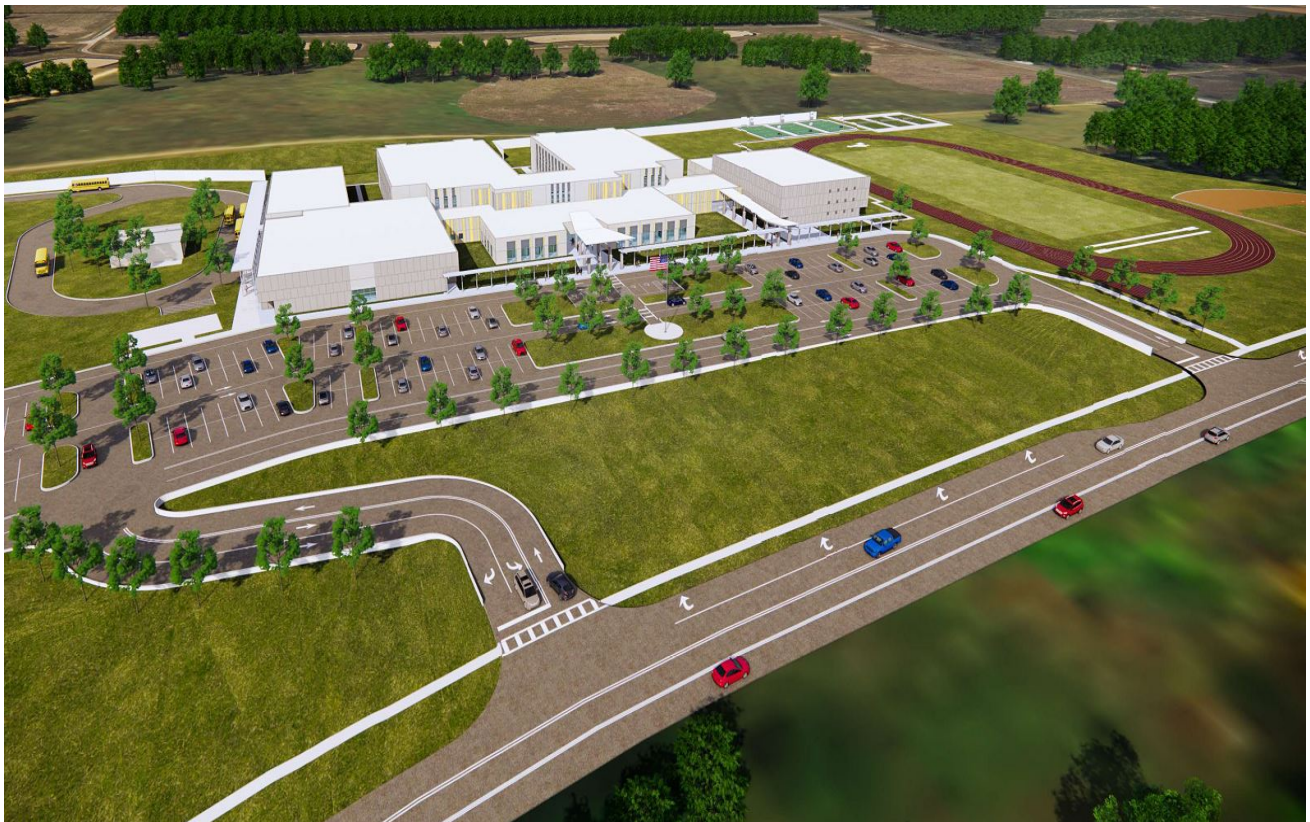
Site 132-M-W-4 rendering

The project is anticipated to be completed late May 2022.