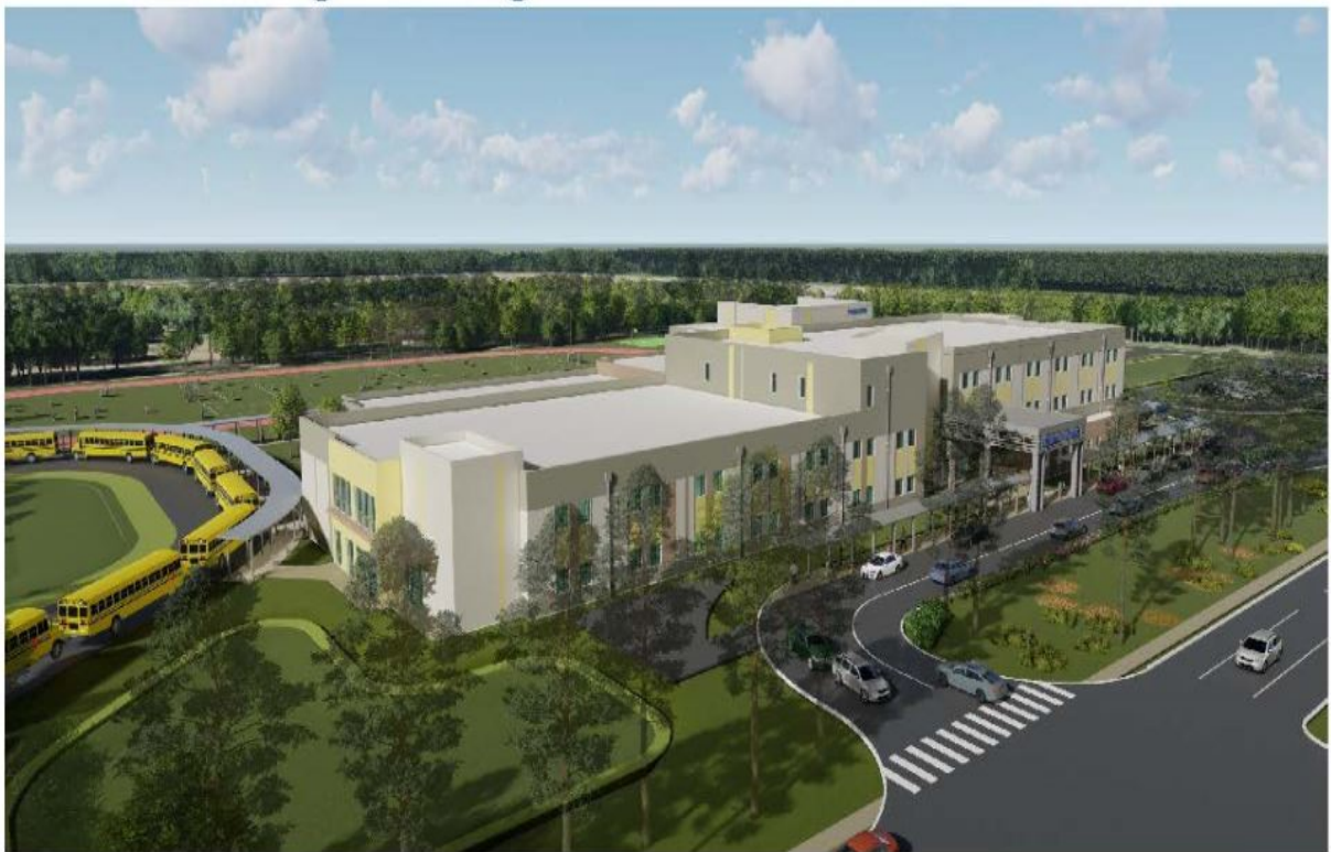
Site 90-K8-N-7 rendering

The project is anticipated to be completed late May 2022.